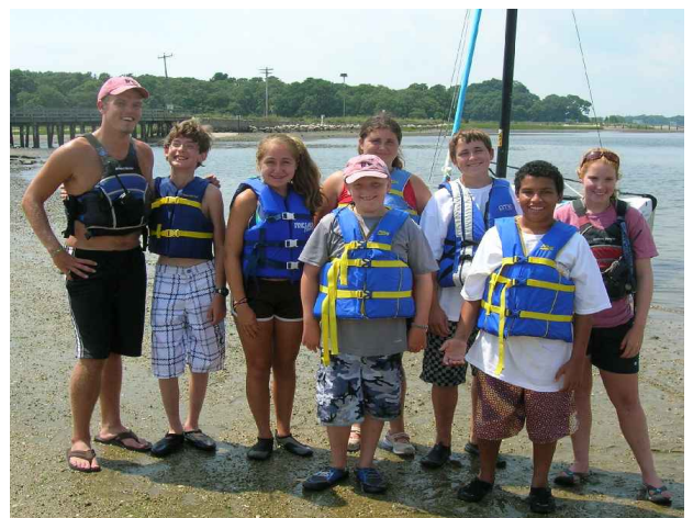
Adventurers Session B

We are always looking to improve our program. Your donations help to fund our scholarships and costs for new boats!