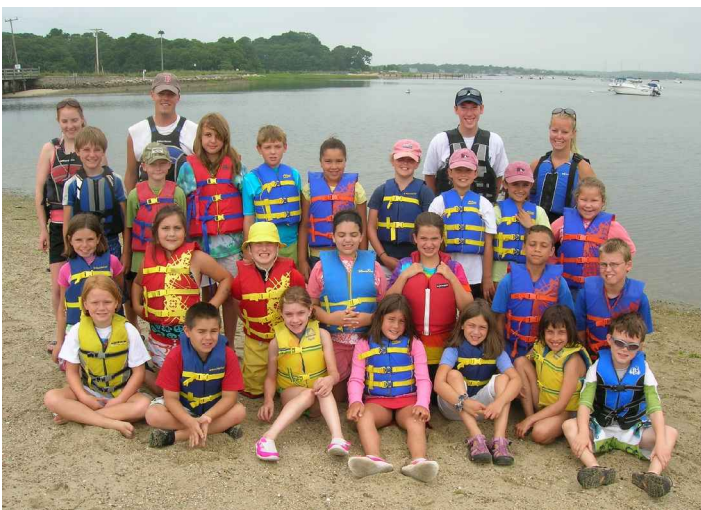
Beginners Session A