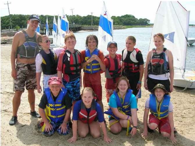
Intermediates Session A