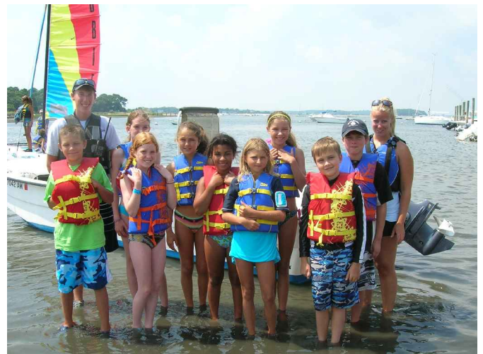
Intermediates Session B

Bourne Community Boating PO Box 3157 Bourne, MA 02532