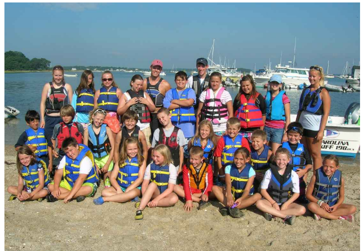
Beginners Session B